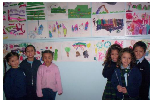
PK and K students showing their artwork

Supported with a grant from the Patron's Program, The Creative Classrooms Art Program encourages students in Grades PK – 2 to create works of art that reflect art making concepts learned in class.