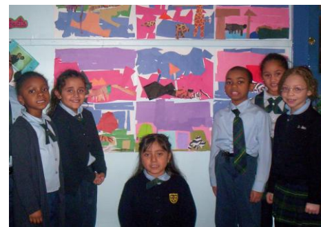
Grades 1 and 2 Students showing their artwork

As students learn techniques and skills appropriate for use with a wide variety of art materials, they begin to develop a personal, unique style and approach that becomes apparent in the art they create. In addition to the hands-on learning, students study the works of significant artists from many time periods, and become familiar with the process of art criticism through class discussion of their own work, and that of their classmates. Creative Classroom's professional visual arts staff, Karina Cavet worked with our Grade PK – 2 students for six weeks. Grades 1 – 2 participated in a collage project inspired by Edward Hick's paint the Peaceable Kingdom while PK – K explored various media (water color, collage, pastel crayons, clay and 3D design) that came through from listening and remembering stories and poems that were read aloud.